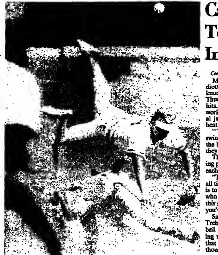
Tom Candiotti of the Cardinals, upset by the Giants' Kevin Mitchell, could not get a double play in a game that saw eight errors made.